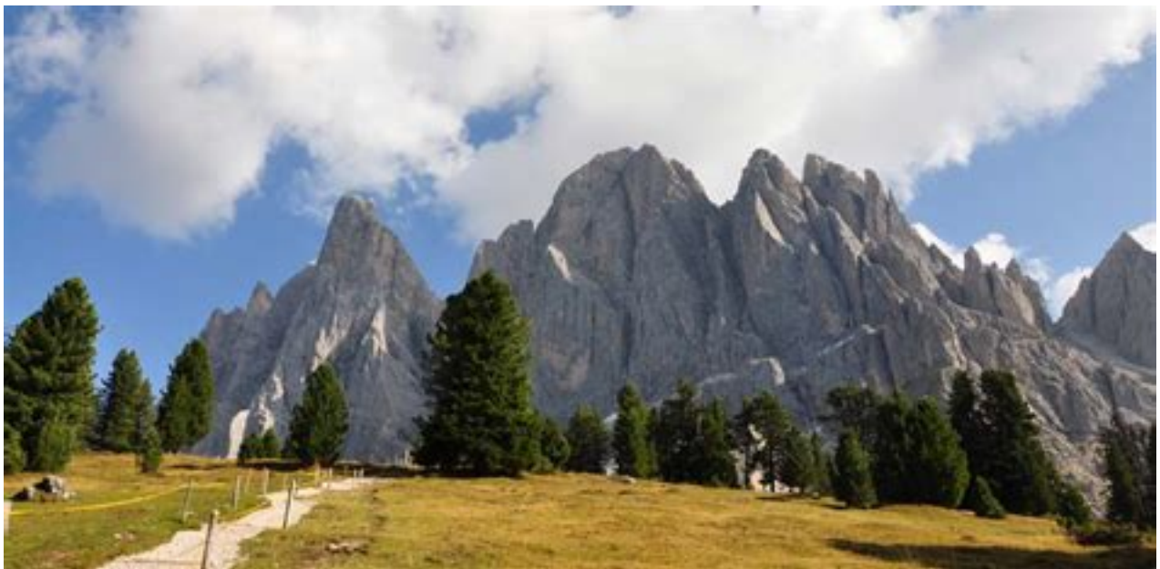
Trekking plan and view from the Adolf Munkel Weg.